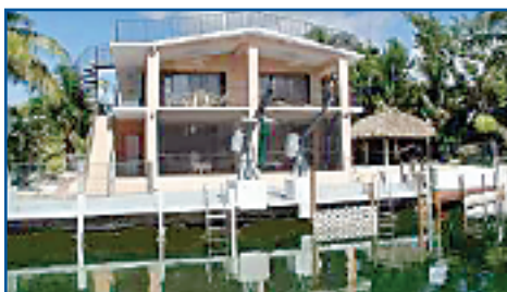
Concrete Fortress! Ocean View! CBS Home w Concrete Roof on a Direct Ocean access crystal clear canal. Cul-de-sac location. 2Bd/2Ba w Cathedral ceilings, open floor plan, Porcelain tile floors & Granite kitchen counters. Roof-top 'Star-deck'. 1B/1B down w garage, storage & large outdoor entertainment area. Fenced backyard, Tiki Hut, Concrete dock w Boat & Jet-ski Davits. $1,199,000