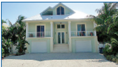
Custom Built Home 2004! CBS w Concrete Roof. 3B/3B 2862sf. Designer interior Door Casings & Trim Moldings, 8' doors. Beautiful Kitchen w SS appl's Granite & fine wood cabinetry. Marble Baths w Glass Showers. 3rd floor M bedroom suite. Panoramic Bayviews from Balcony & Sundeck. 70' deepwater concrete dock, 15K Boat lift, 30amp shore power. 2 2 Car Garages. $1,250,000