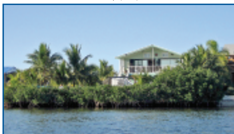
Private Oceanside Location! 5B/3B Built for an extended family. 2 Kitchens, 2 Living Areas, 2 Laundry rooms all on 2nd level w separate entrances & Balconies. Completely remodeled w Tile floors, Impact Windows & Metal Roof. 300' on the water, oversized lot, protected canal dockage. Large ground level storage/workshop. Oceanside on Newport Bay, Easy to Ocean or Bay. $995,000