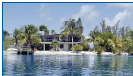
Concrete Fortress on Open Water Basin! 3B/3B CBS w Concrete Roof & HD Storm Shutters. 175' of Waterfront on a large Basin that junctions w 3 Canals. 2B/2B up w New Tile Floors. Granite Kitchen w SS Appl. Lovely water views from living areas & M Bdrm. Cathedral ceilings & Screened w tile Balcony. 1 Bath & 2 rooms w screened patio down. Newly Built HD 60'Dock. TROPICALLY Landscaped Lot. $799,000