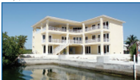
Spectacular Views of Rock Harbor! 4000 sf living area. 3 Story 4B/3.5B home built in 2007. Granite kitchen w/SS appliances & fine wood cabinetry. Porcelain Tile flooring throughout. Elevator. Huge Living & Dining area w Single Light French Doors, opens to outdoor Patio's & Balconies. 4 separate wings for the bdrms, 1 can be used for an office w a separate entrance. Two 2 Car Garages. $1,199,000