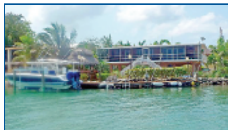
Bay Front Home! Stillwright Point! CBS w Concrete Roof 4B/3B, Deepwater dockage w 2 4post Boat Lifts. Chef's Island Kitchen w Granite Counters. Tongue & Groove ceiling, Open Floor Plan w Spacious Bedrooms & Steam shower. French doors lead to a huge screen balcony. Large elevated Tiki-Hut. Brick Paver Patio, driveways & walkways. Grass & Sand dunes blend into a Tropical Beachy setting. $1,299,000