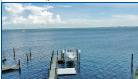
Paradise on the Bay! 3 Story CBS Bayfront Home, built in 2000 w 3B/2.5B 2000sf. 3rd floor master suite w walk-in closet & Breakfast Bar, Jacuzzi Tub & private Balcony overlooking the Bay. Chef's Kitchen w Granite Tile. Huge balcony w panoramic views of the Bay. T Dock w 4 post boat lift. Deepwater, easy Ocean Access via Adams Waterway. Great Location for Fun, Fishing, Swimming & Boating. $949,000