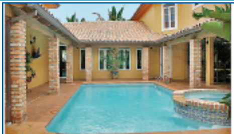
Stunning Port Largo Courtyard Pool Home! Custom Built 3B/3.5B CBS w Barrel Tile Roof. Granite Kitchen w SS appliances. Master suite on a 2nd floor private wing. Covered Outdoor Kitchen & dining area w TV & Stereo & lounge area next to pool, also Cabana Bath w Bonus room for guest quarters. Tiki Hut w 2TV's & Stereo. 75' Concrete Dock, Davits & Boat lift. Deepwater, direct Ocean access. $2,400,000