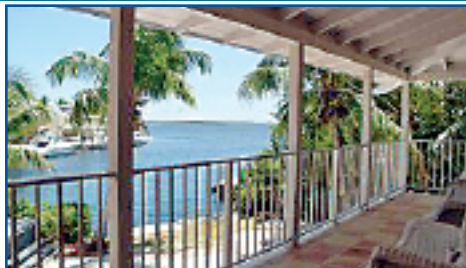
Key West Island Style Home! 3Bd/2B CBS & Concrete Home. Wrap around porch with sliding glass doors that pocket to extend the Living area to the outdoors w Open Water View. Beamed Cathedral ceiling. Designer Kitchen w glass & wood Cabinets, granite counters. Downstairs bedroom, bath & game room. Professionally Landscaped. 160' of waterfront & 60' protected dockage & beach. $1,390,000