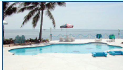
Big Boats Welcome! Oceanfront Pool Home! 3 Story CBS, 5bd/3.5Ba 5328sf. Protected Deepwater Dockage & Panoramic Ocean Views. Custom built home on a Tropical landscaped Peninsular w 360 of waterfront. Pristine condition. Beamed Cathedral Ceilings, an Island kitchen w SS Double Oven & Glass Cook-top, Formal Dining Room. Marina w Two 54 Boat Slips, Davits & 220/110 Shore Power. $1,999,000