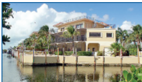
Unobstructed Ocean Views! Pool! 154' Dockage! 3 Story CBS w Concrete Roof. 5B/3B 4727sf w 3rd floor Master Suite. Granite Kitchen. Tile & Marble floors & Bathrooms. Huge living area w Ocean views. Large Screened Patios & Balconies, also Rooftop Deck. Walled & Gated oversized lot with cut in Boat Slip for large boat & 2 sets of Davits. MM 100 Located on turn Basin w direct Ocean access. $1,479,000